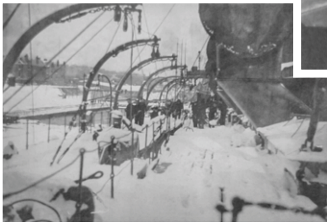
Boat deck (HMCS Niobe) in winter, 1911.

“ This album has some amazing images, complete with captions, and showcases the careers and lives of the Brodeurs.