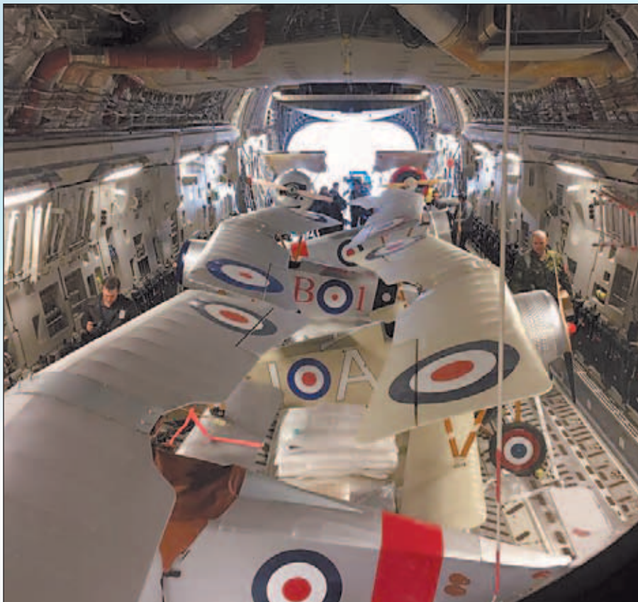
It's like a jigsaw puzzle. The Vimy Flight Association's aircraft are safely stowed in the CC-177 Globemaster III.

But he didn't stay away long. While driving by the Victoria International Airport a few years back he noticed two Nieuports landing. He went to the