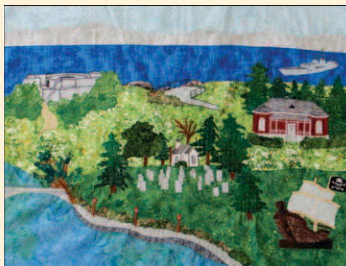
This colourful quilt block featuring notable Esquimalt landmarks – including the heritage building that houses CFB Esquimalt Naval and Military Museum’s archives and offices in Naden 20 – is part of a larger project to mark the Capital Regional District’s 50th year in operation.

The Esquimalt quilt block displays a number of notable landmarks within the municipality that are important and recognizable to local residents. These landmarks include Macaulay Point, Saxe Point, a pirate ship to represent Buccaneer Days, the Naval base at CFB Esquimalt and the CFB